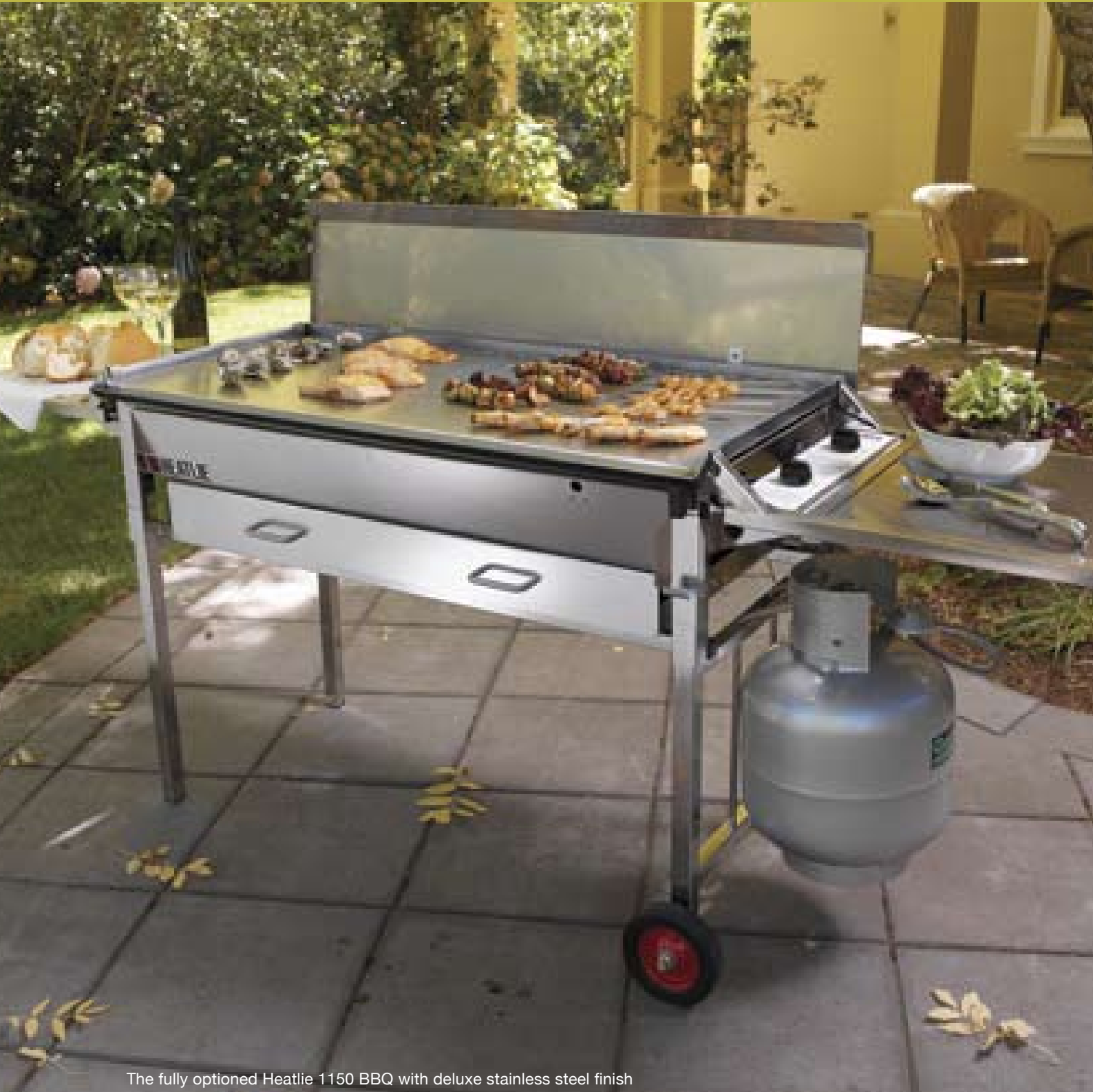
The fully optioned Heatlie 1150 BBQ with deluxe stainless steel finish