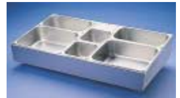
Converts easily to a bain marie which keeps food warm and ready for serving. Great for crowds.